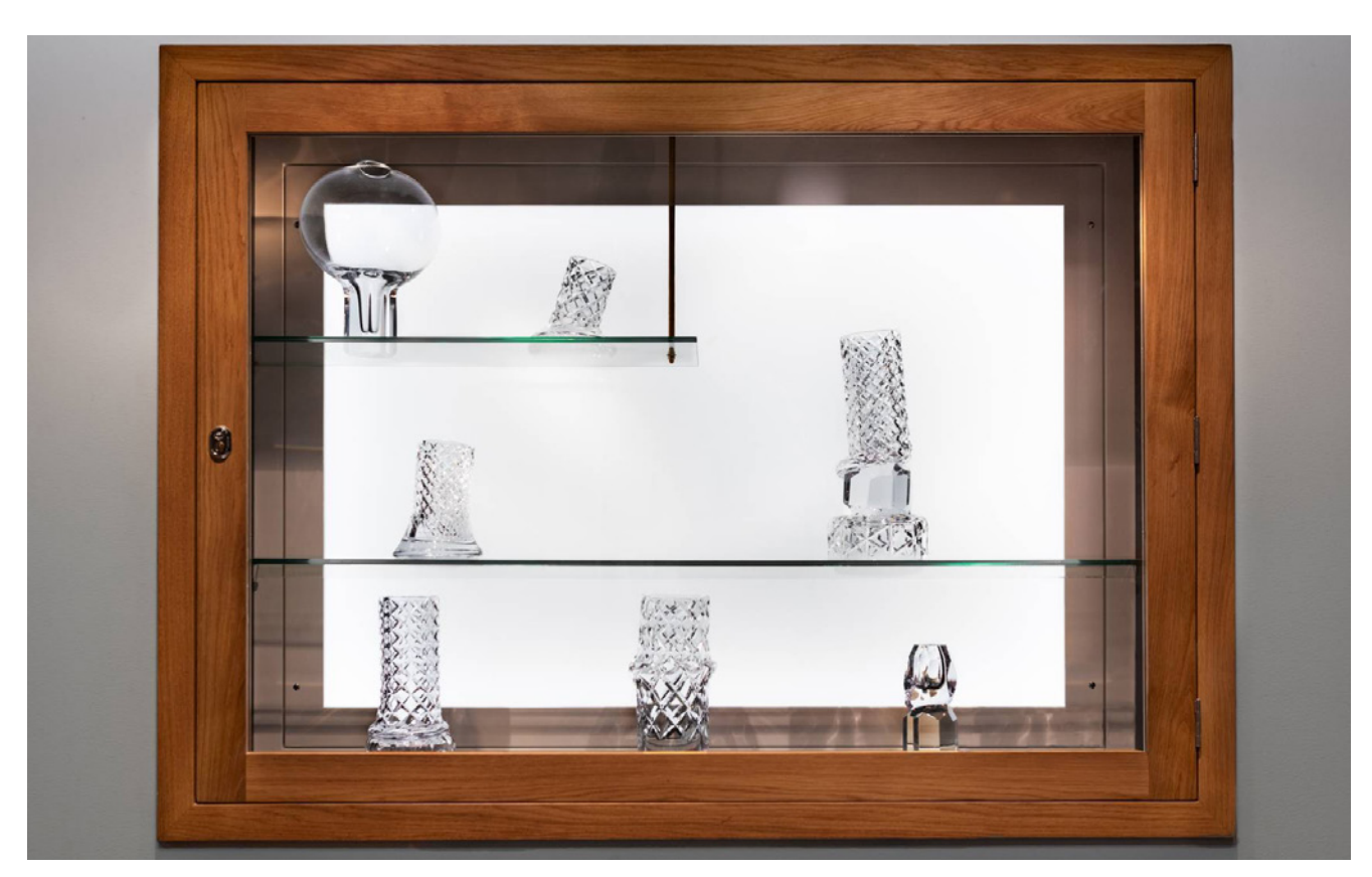
Glass art by artiest Simon Klenell. The sculpture is in the entrance to Parkhusen in Larsberg on Lidingö.